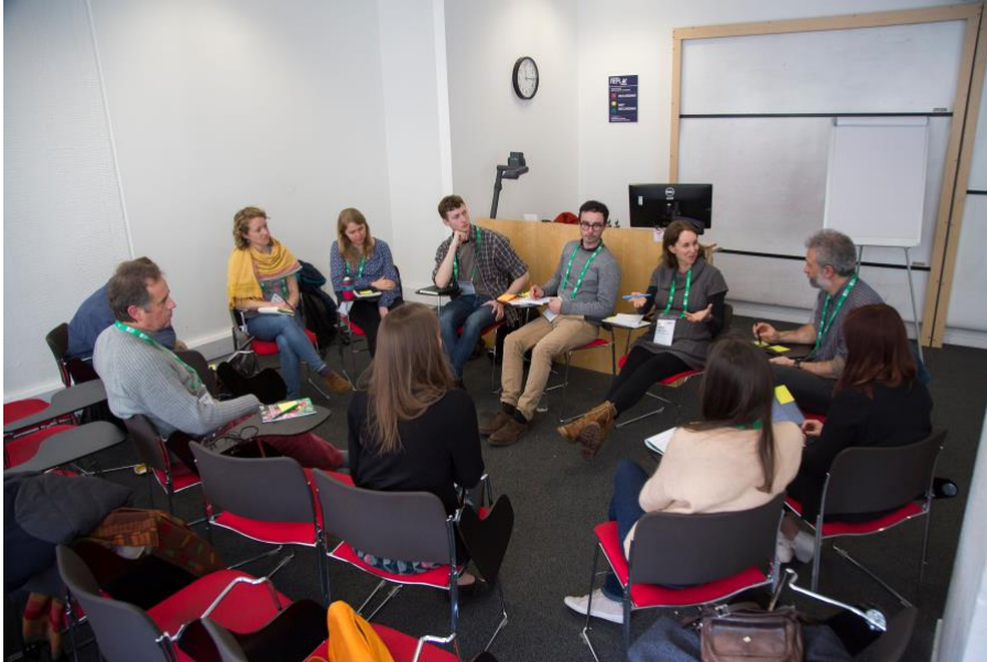
Discussion round at the gtö – BES meeting in Edinburgh.