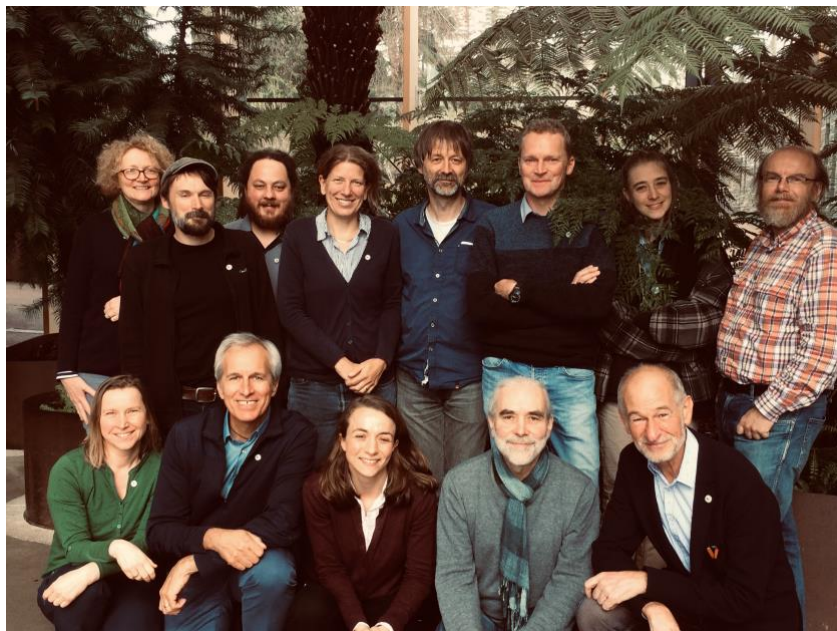
Board members in Edinburgh 2019.