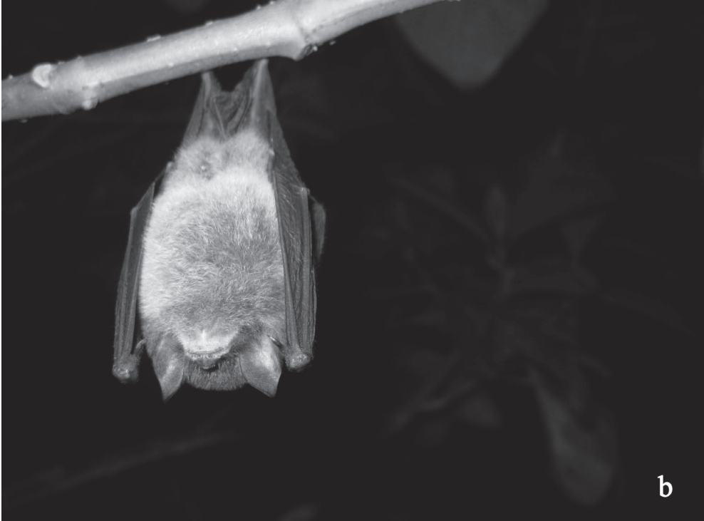
FIG. 1. a) Natalus lanatus from Savegre showing the diagnostic ventral bicolor fur; b) photograph of a live specimen in Orosi, Cartago.